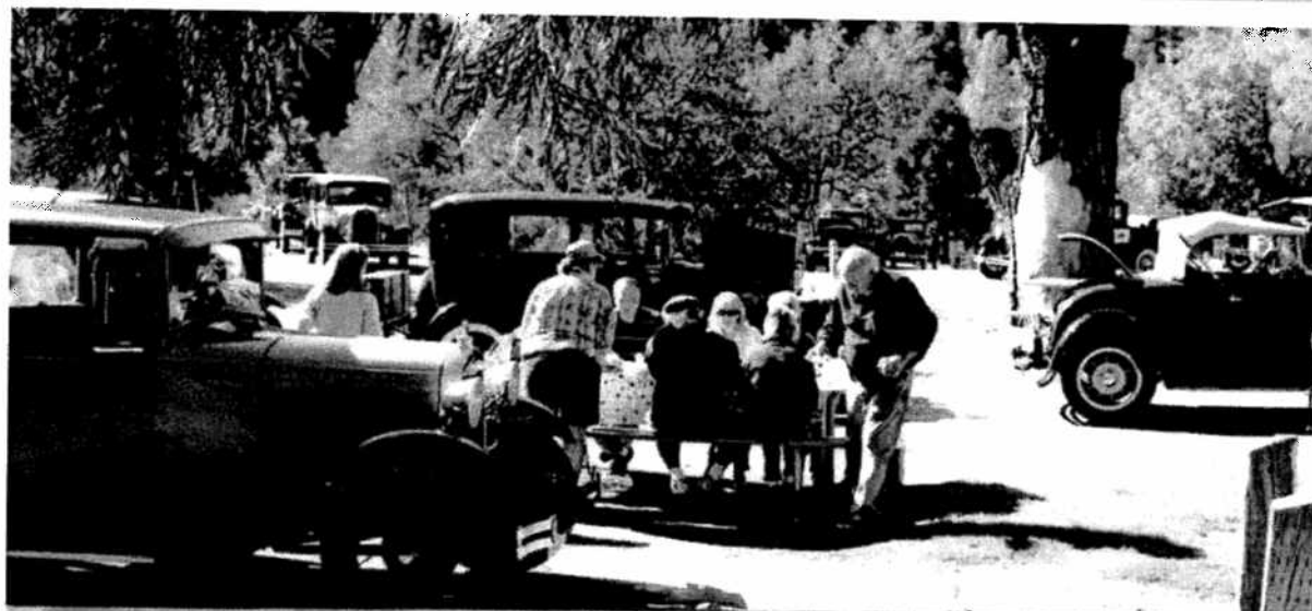
Model A's all over the park – but our interest was in the lunch!